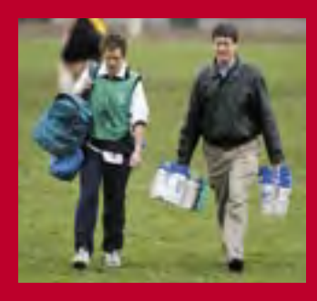
AFL & parents combining for our KICS